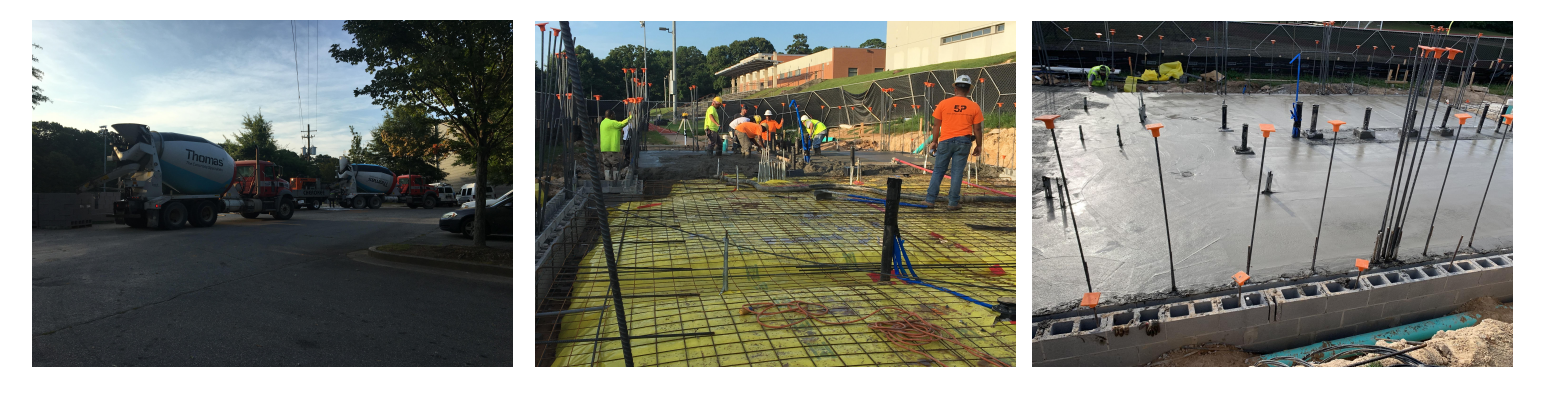
FD- 7AM Concrete Pour- 5 trucks to complete Slab on Grade